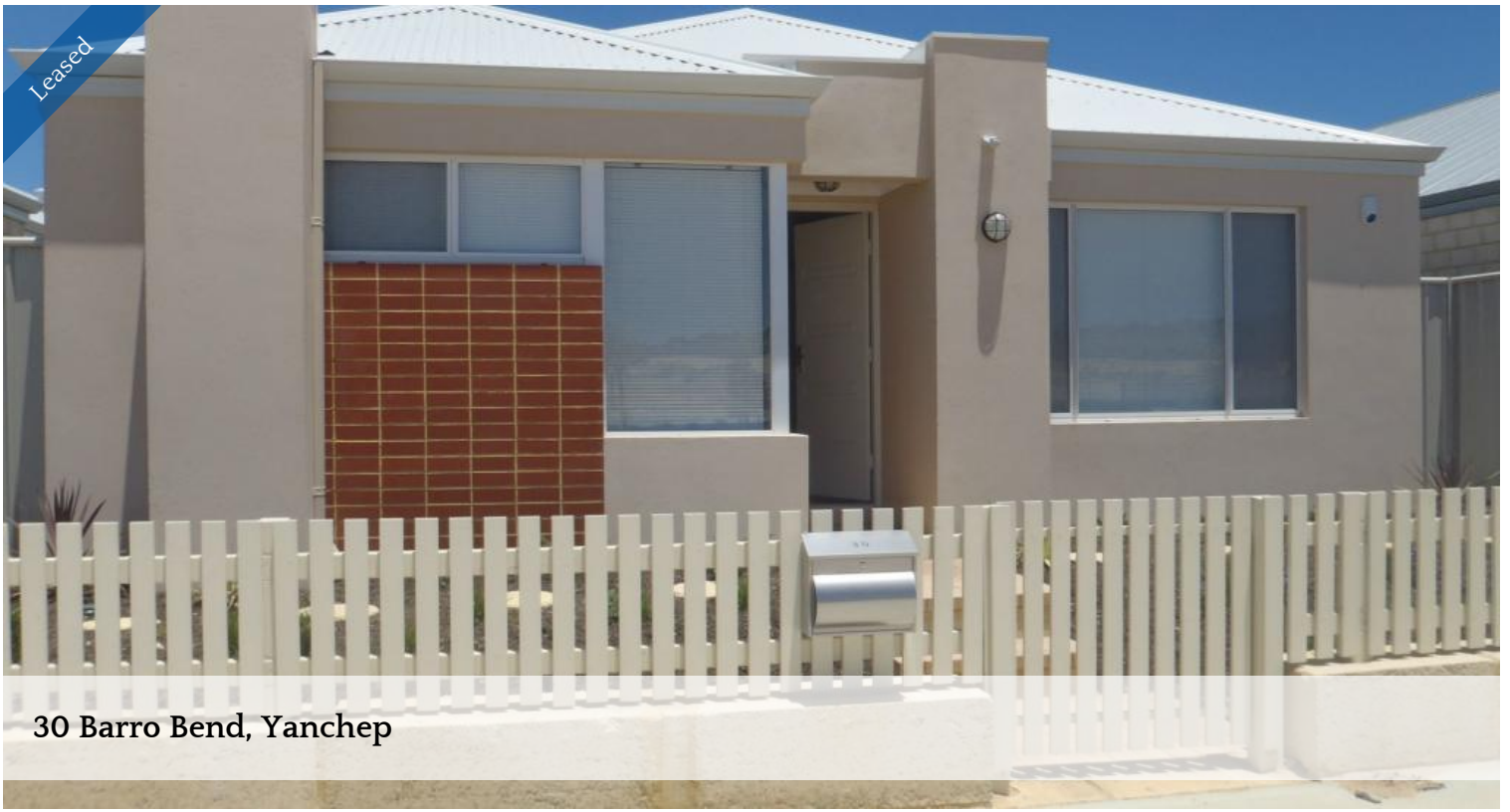
30 Barro Bend, Yanchep