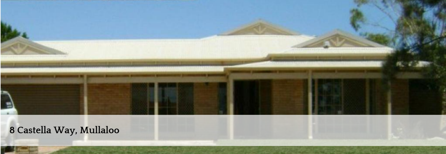
8 Castella Way, Mullaloo