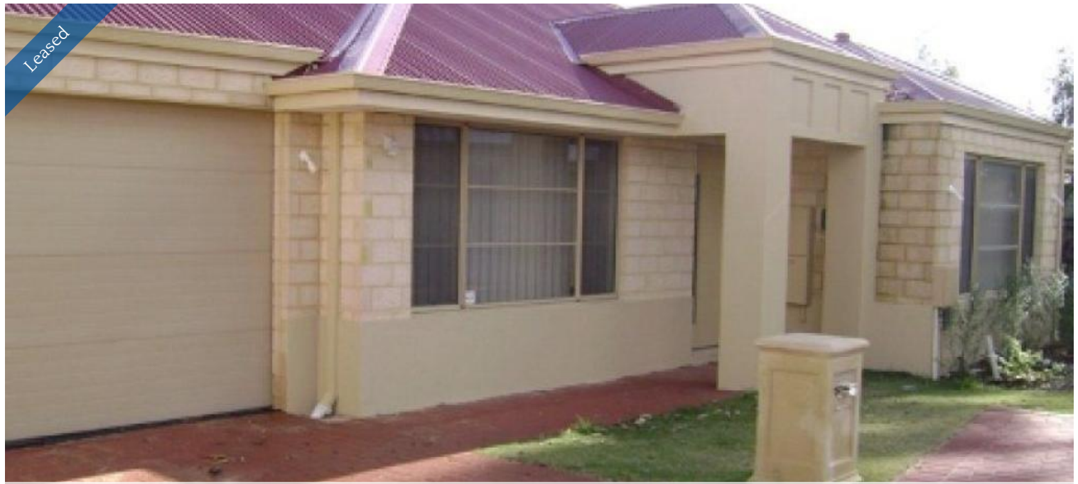
Villa, 15 Yaroomba Place, Clarkson