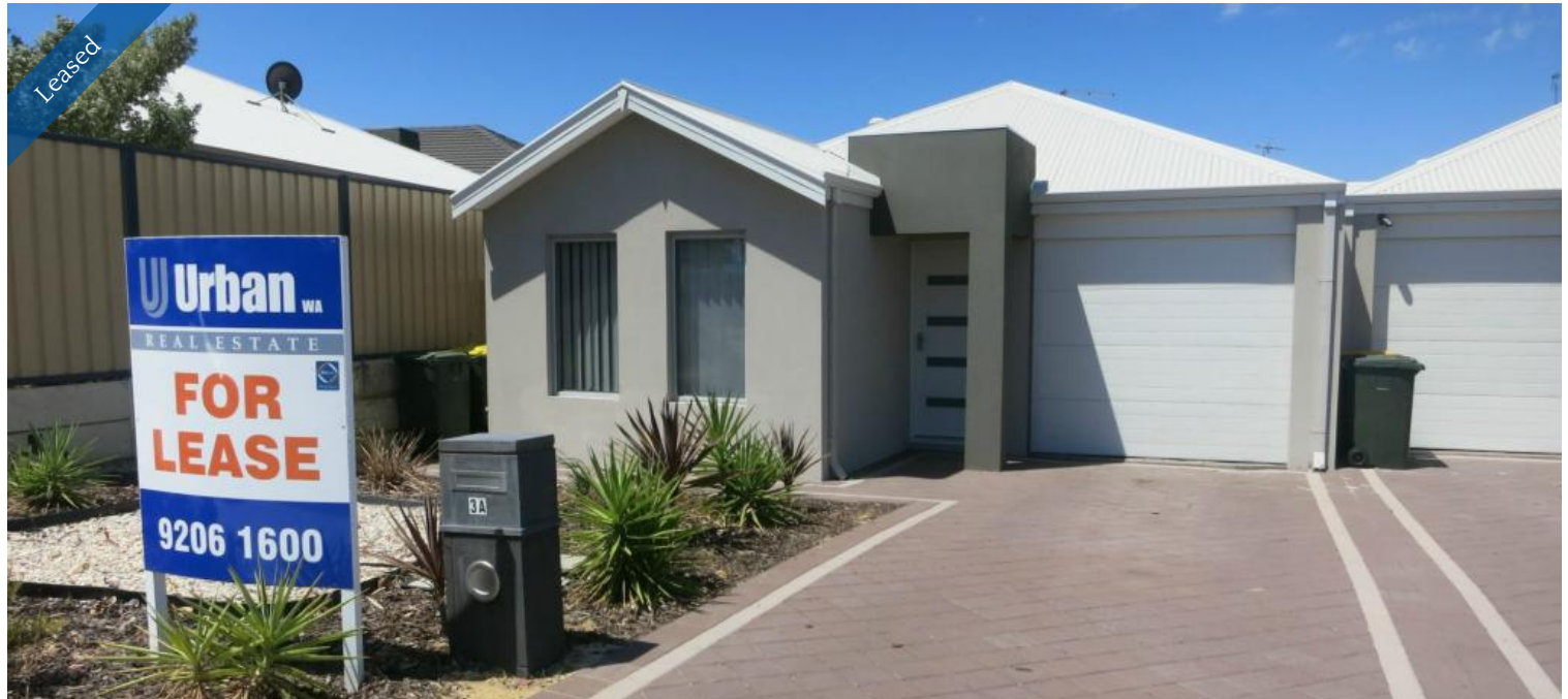
3A Meneguz Drive, Tapping