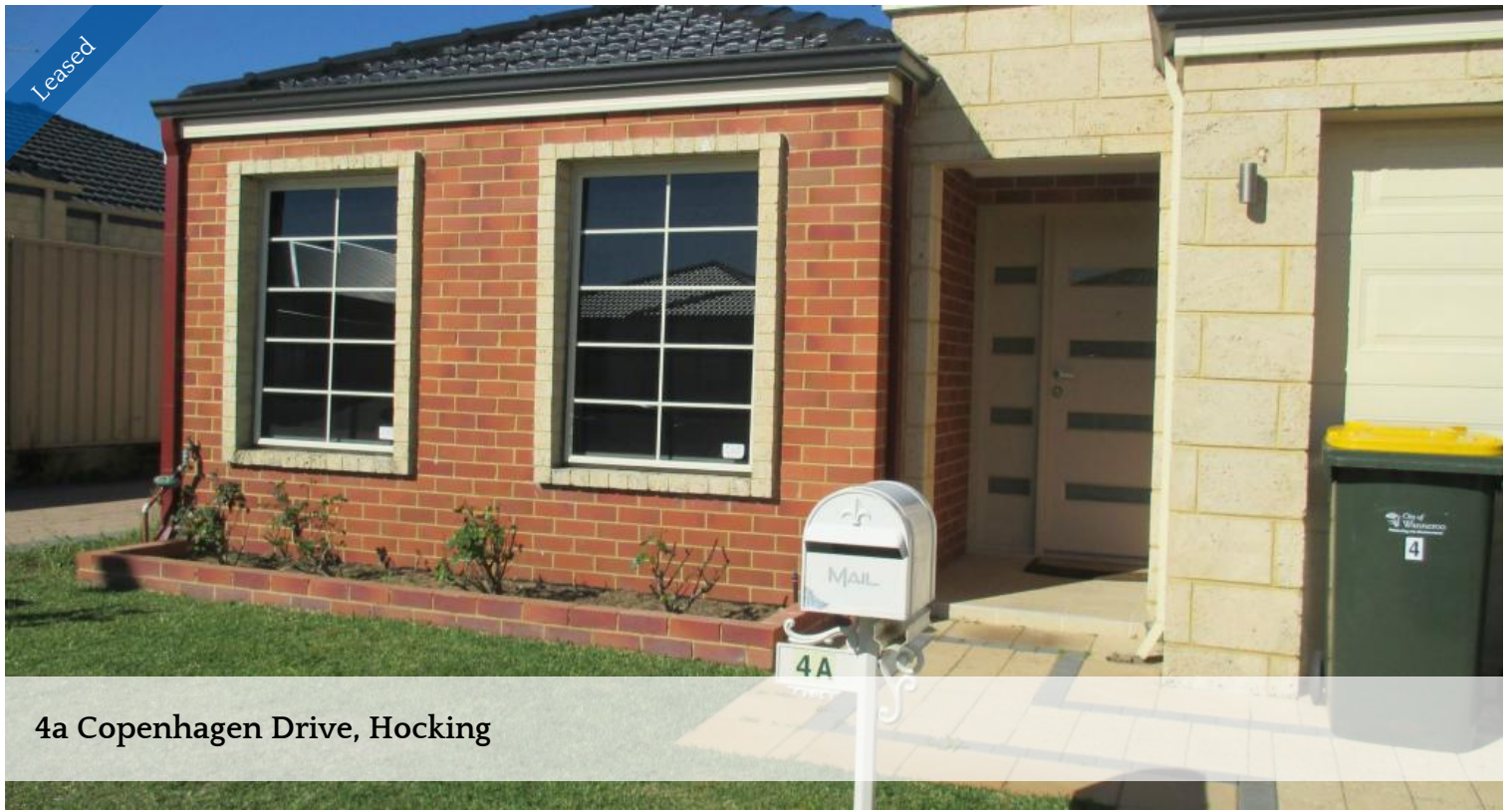
4a Copenhagen Drive, Hocking