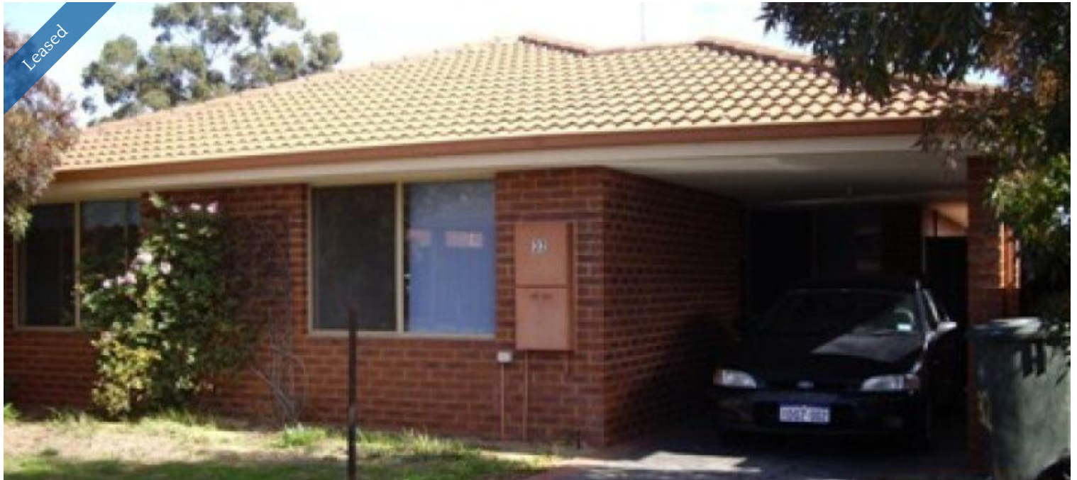
Unit 32, Lot 53 Westgate Way, Marangaroo