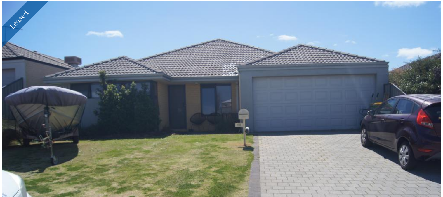
Lot 13 Coolimba Turn Street, Baldivis