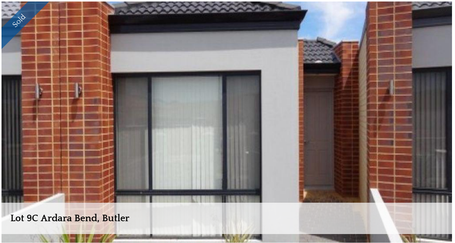
Lot 9C Ardara Bend, Butler