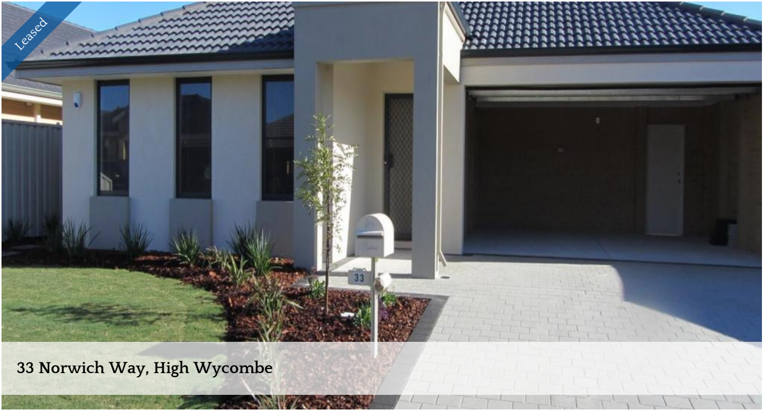
33 Norwich Way, High Wycombe