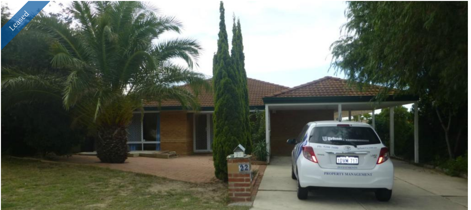
22 Whiston Crescent, Clarkson