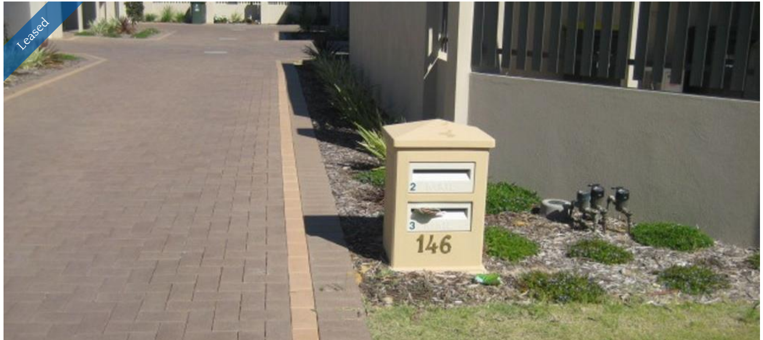
2, 146 Willespie Drive, Pearsall