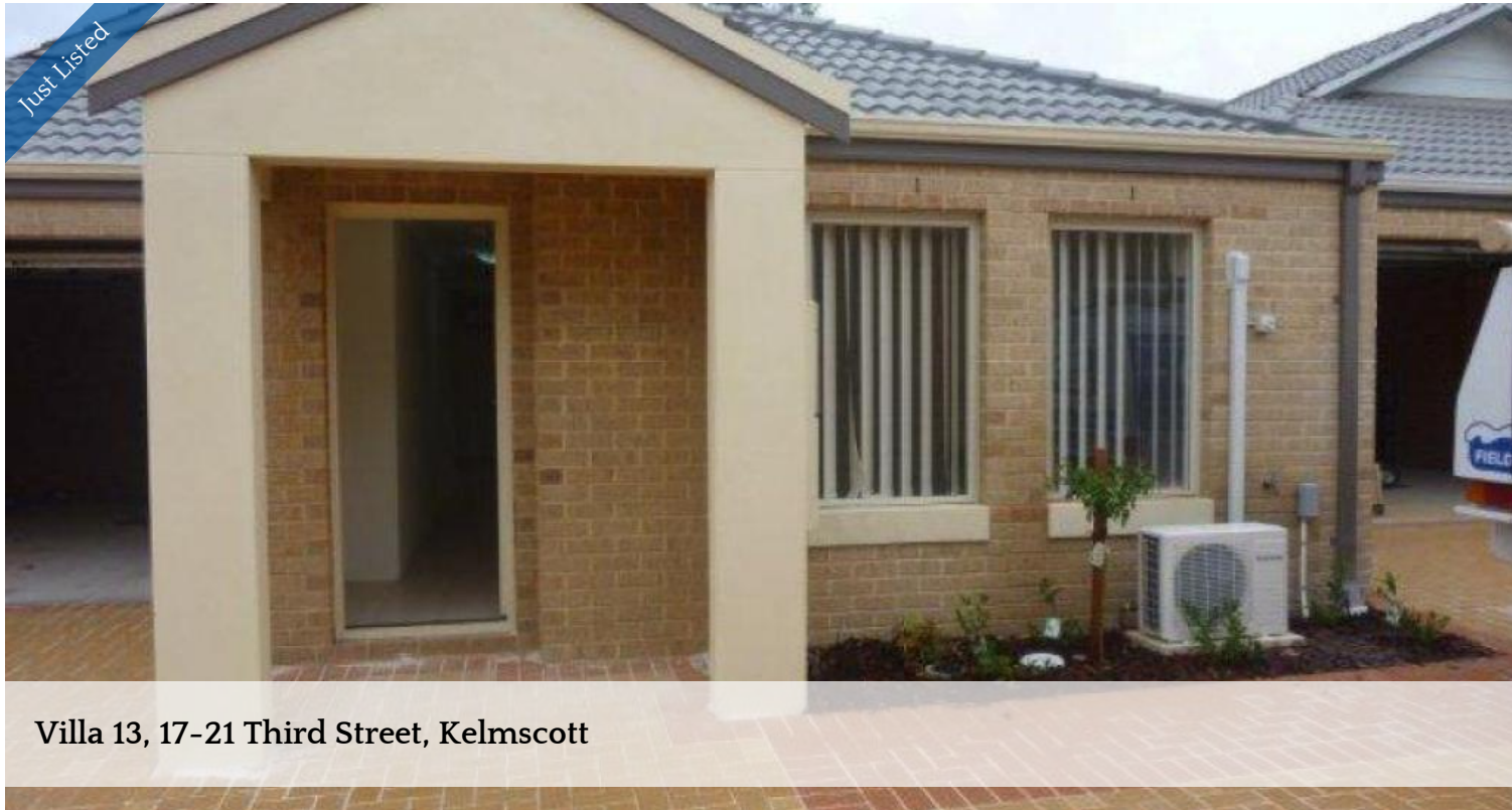
Villa 13, 17-21 Third Street, Kelmscott