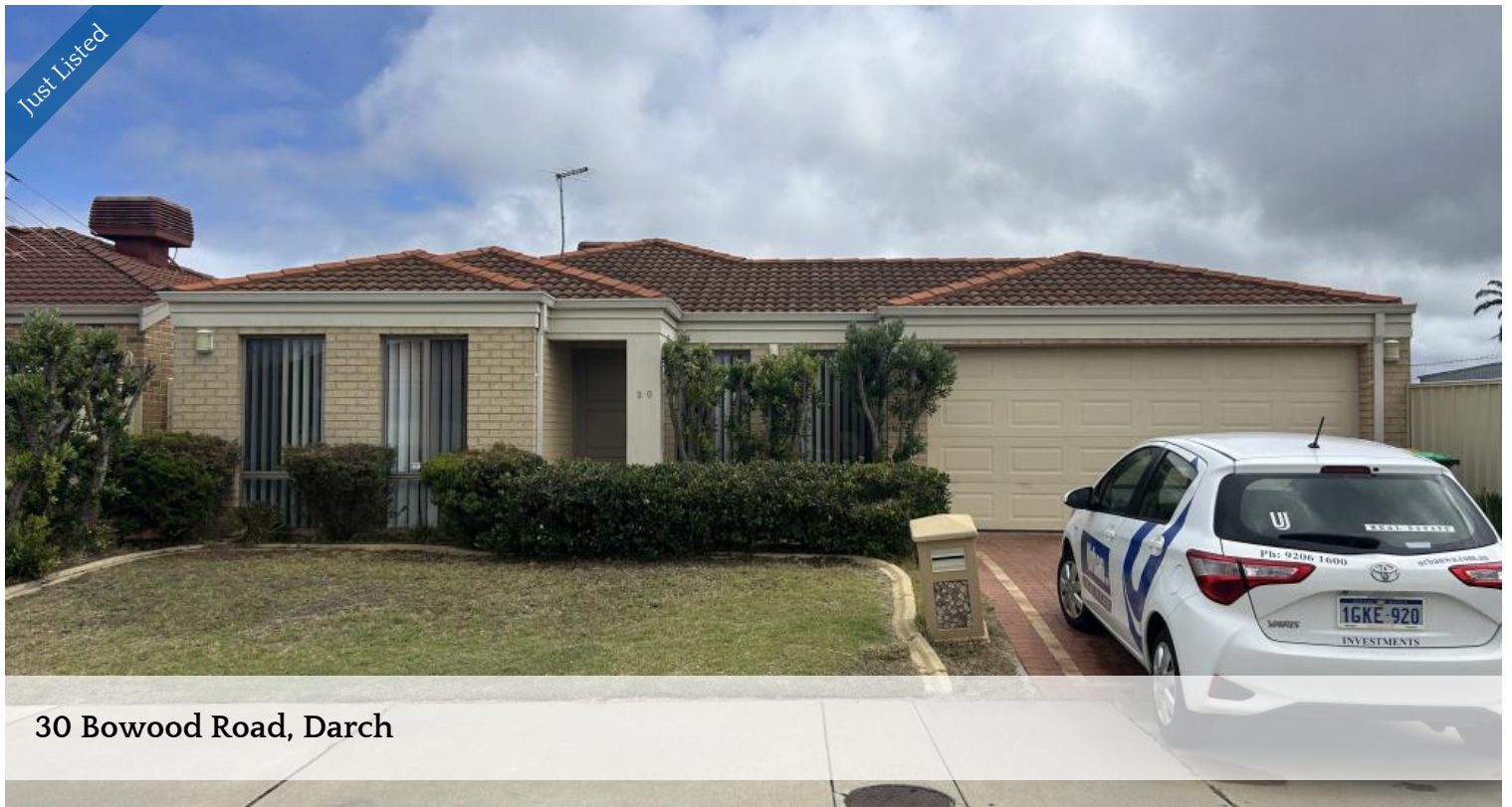
30 Bowood Road, Darch