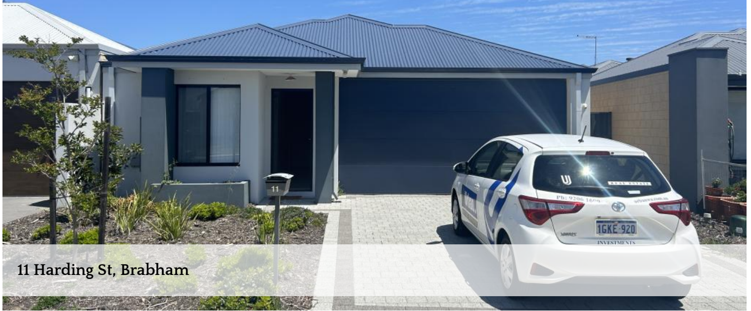
11 Harding St, Brabham