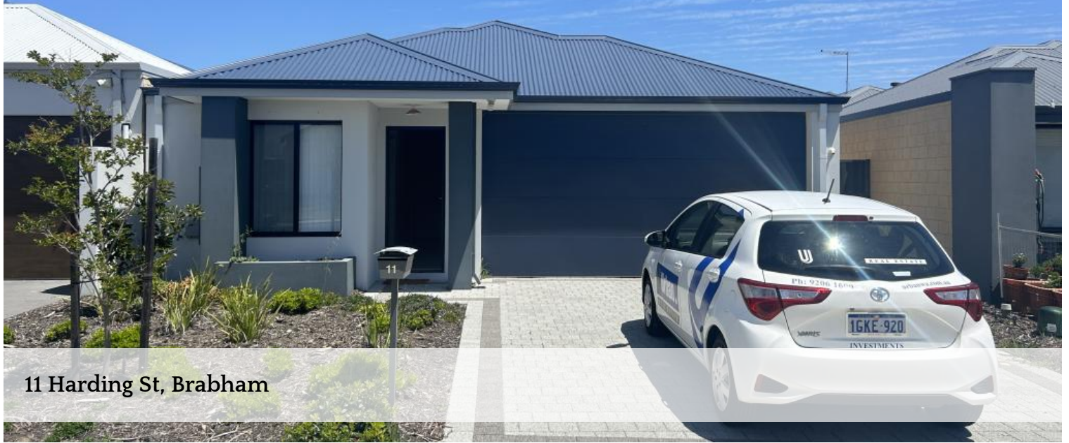
11 Harding St, Brabham