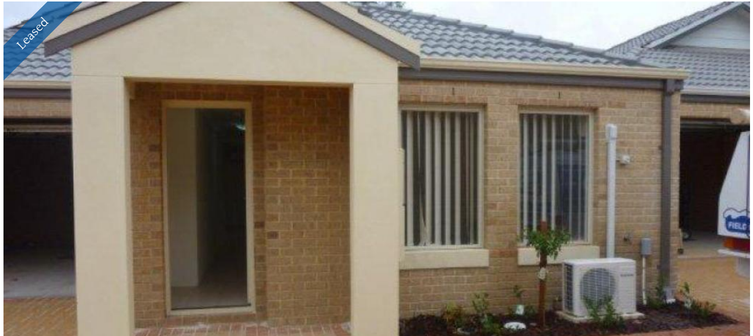
Villa 13, 17-21 Third Street, Kelmscott