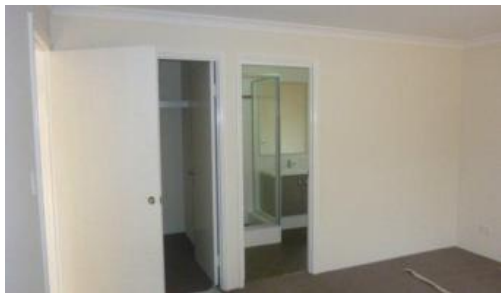
Villa 13, 17-21 Third Street, Kelmscott