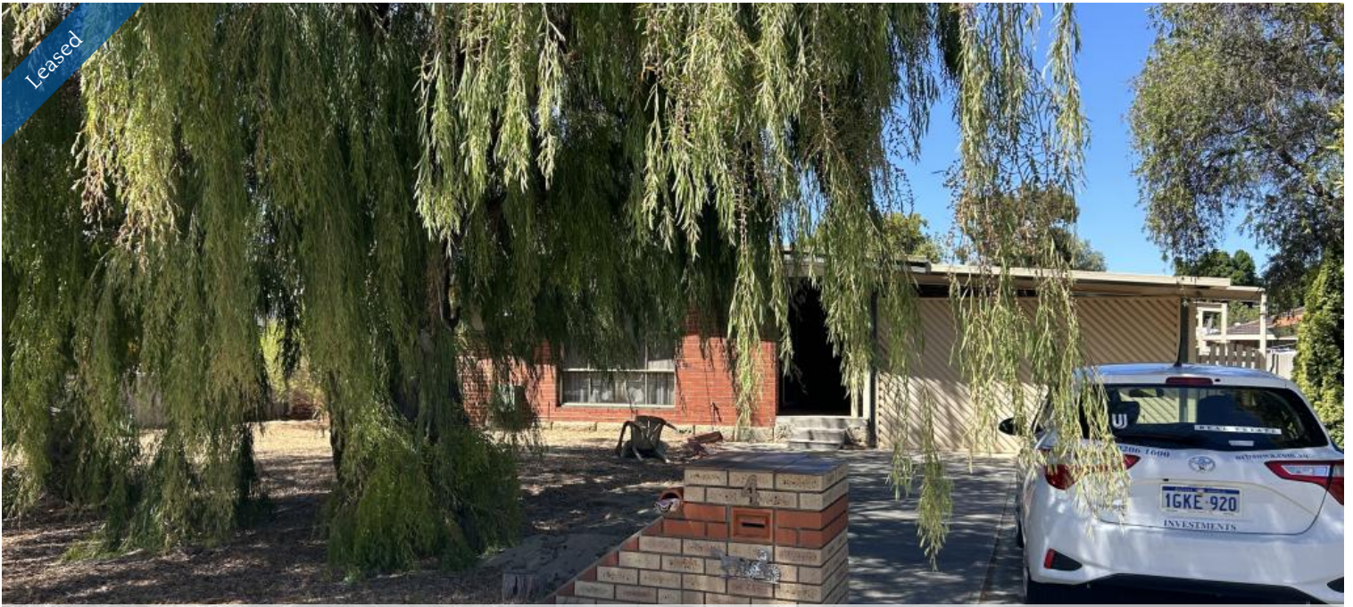
4 Montrose Ave, Girrawheen