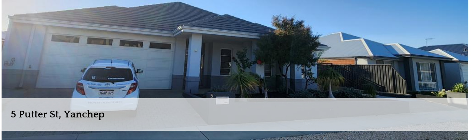
5 Putter St, Yanchep