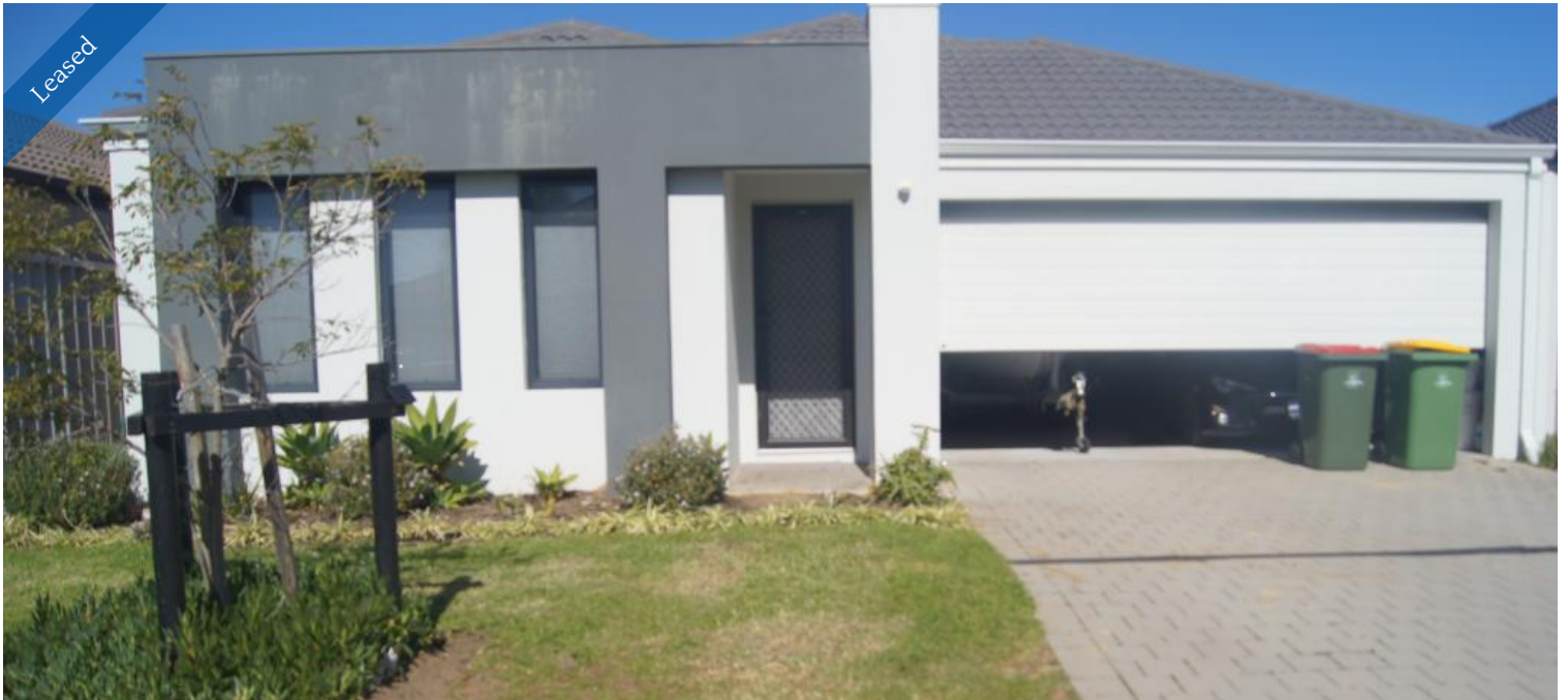
Unit 4, 6 Papillon Rd, Success