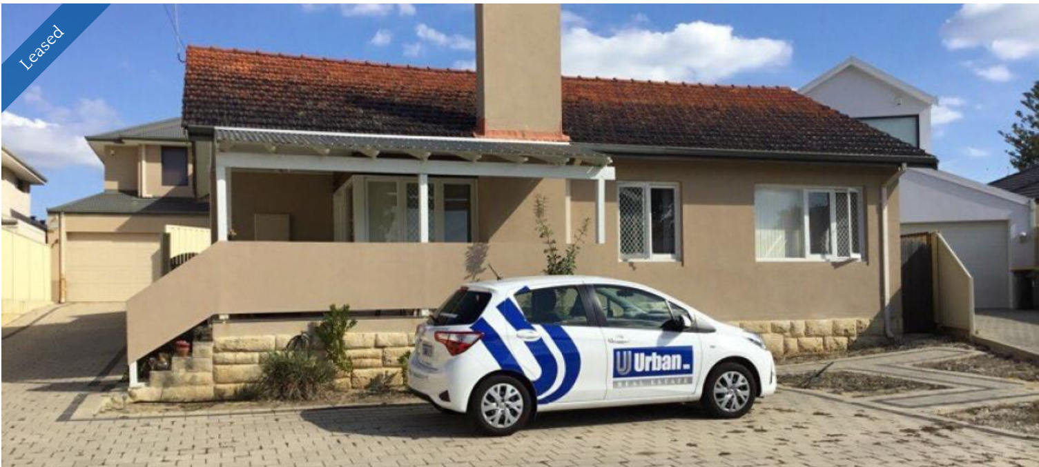
15 Norman St, Karrinyup