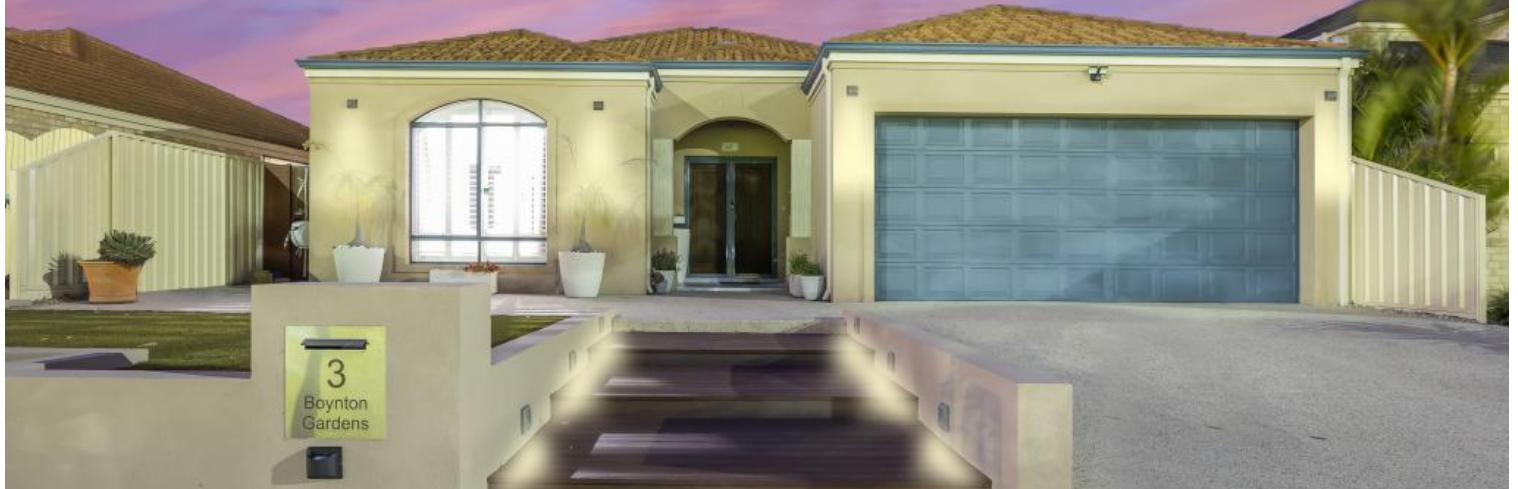
3 Boynton Gdns, Iluka