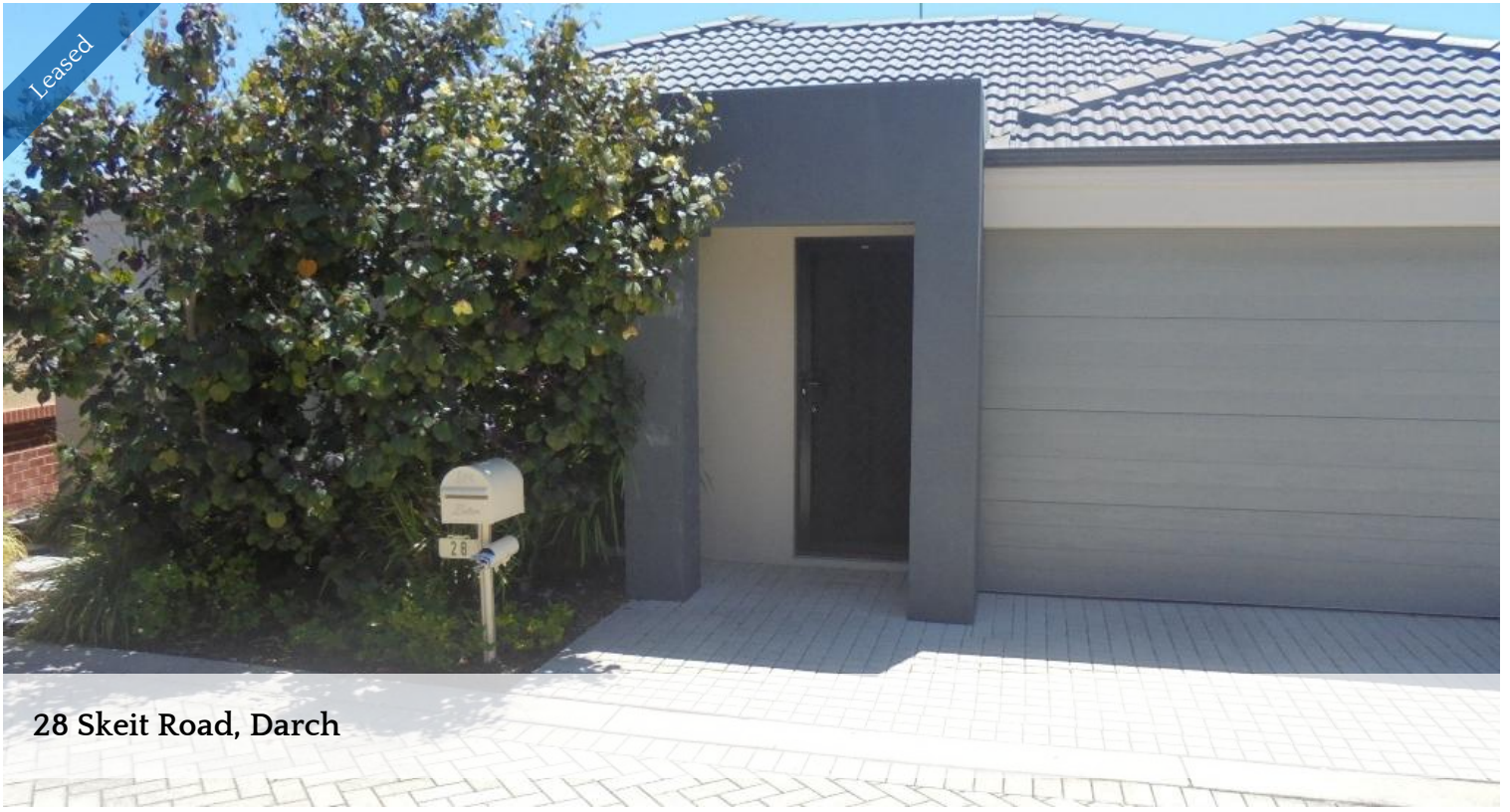
28 Skeit Road, Darch