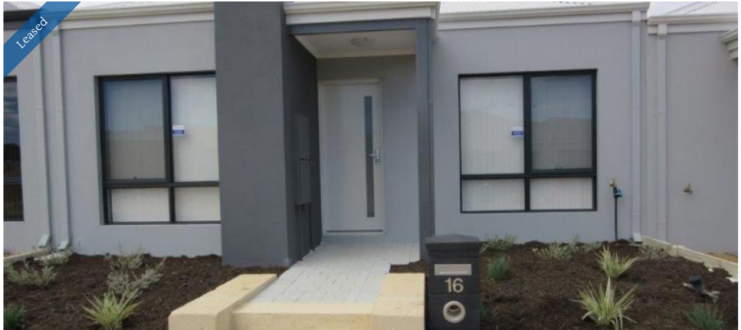
16 Uppingham Way, Butler