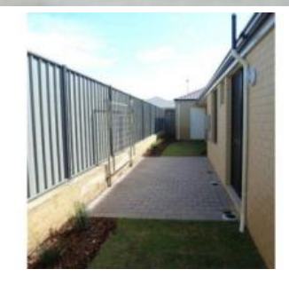
🚔 4 🔊 2 🖨 2

The above information provided has been furnished to us by the vendor/s. We have not verified whether or not that information is accurate and do not have any belief in one way or the other in its accuracy. We do not accept any responsibility to any person for its accuracy and do no more than pass it on. All interested parties should make and rely upon their own inquiries in order to determine whether or not this information is in fact accurate.