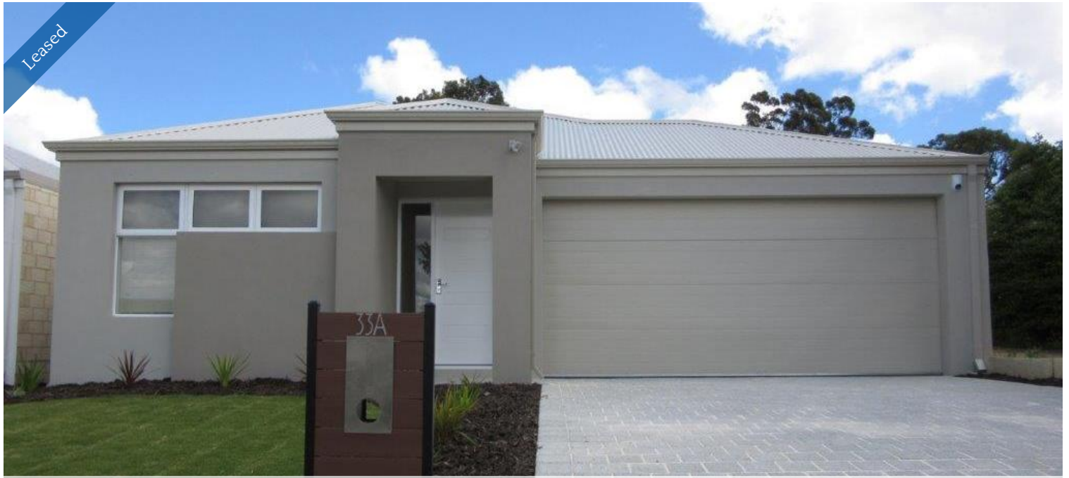
33A Windelya Road, Kardinya