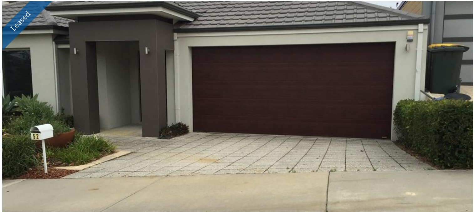
52 Solaia Loop, Woodvale