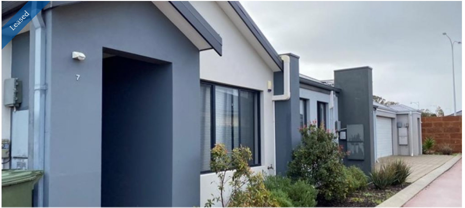
Unit 7, 14 Wallangarra Rd, Carramar