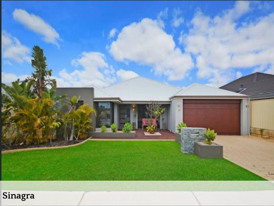
12 Condro Bend, Sinagra