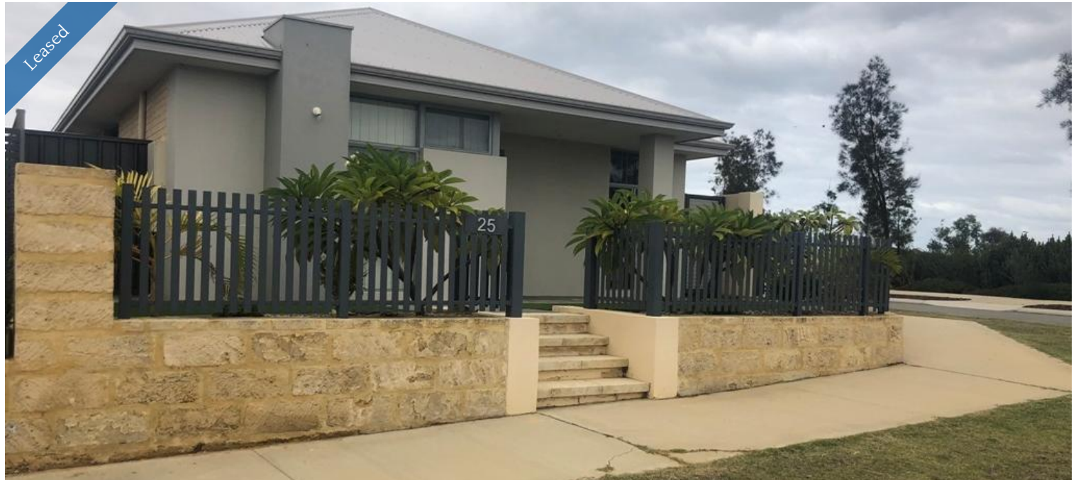
25 Chesham Rise, Alkimos