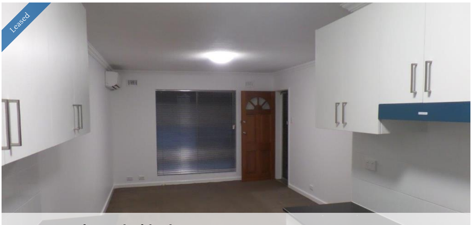
Unit 3, 29 Heard Way, Glendalough