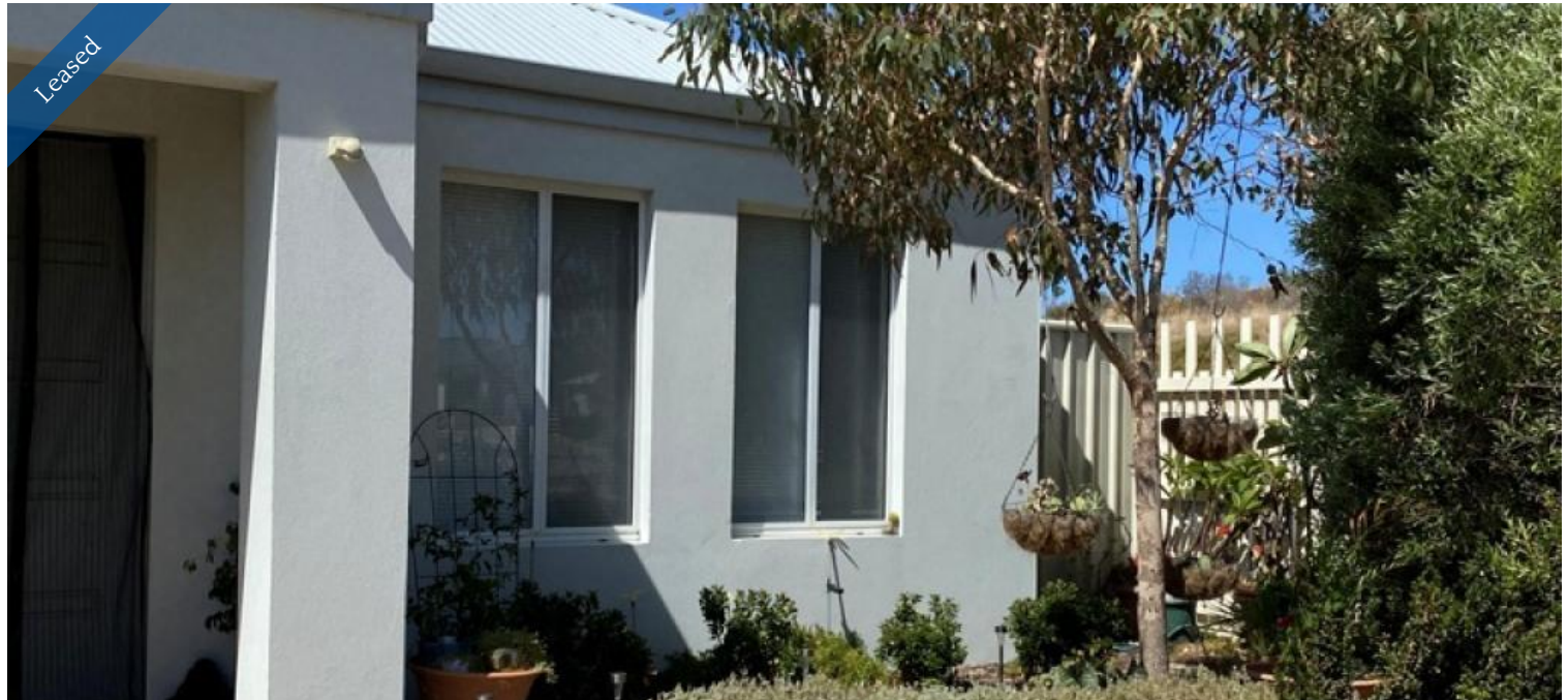
34 Barro Bend, Yanchep