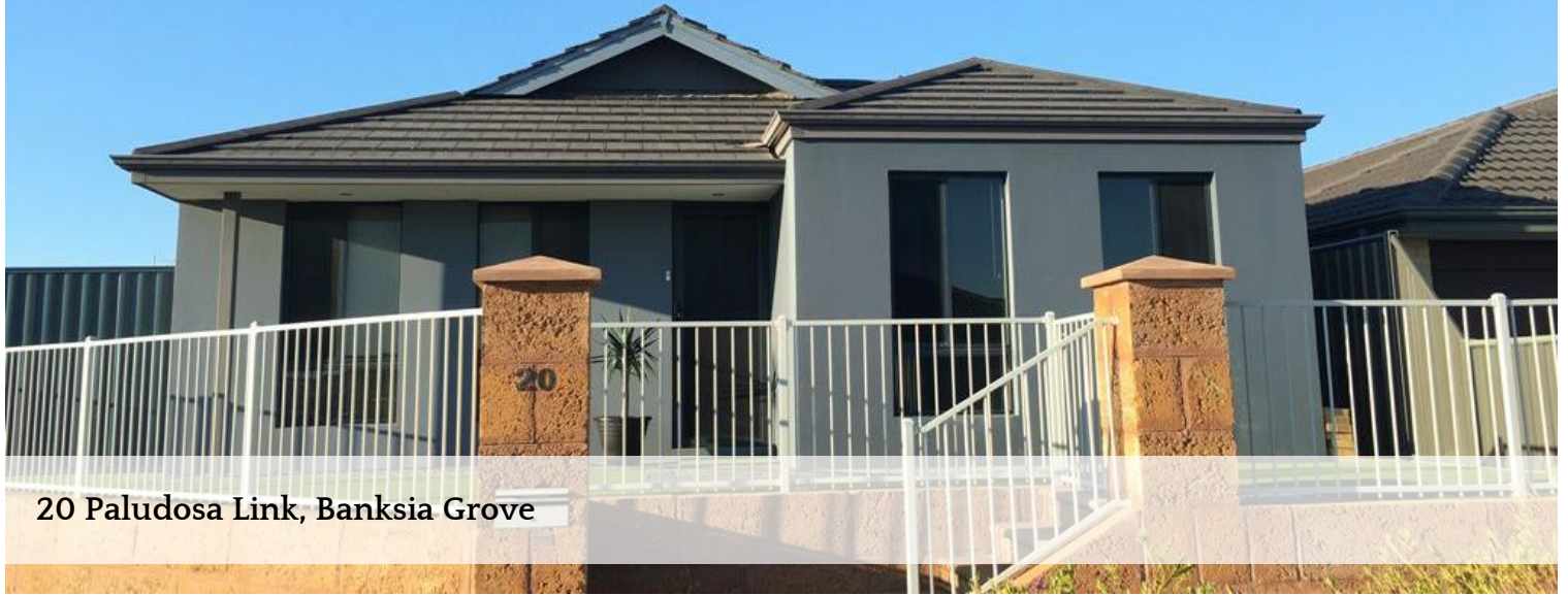
20 Paludosa Link, Banksia Grove