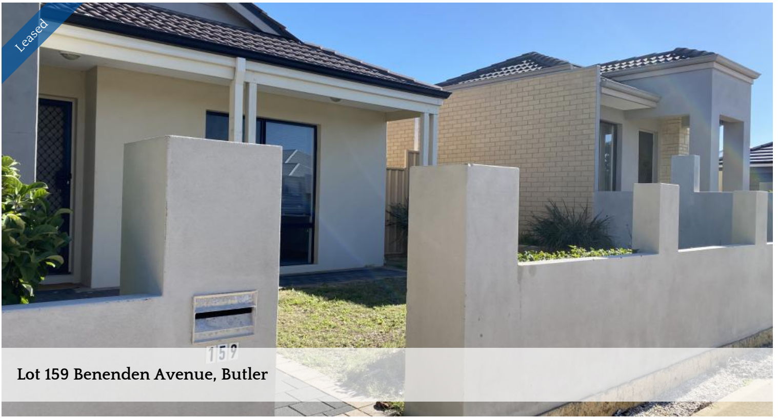
Lot 159 Benenden Avenue, Butler