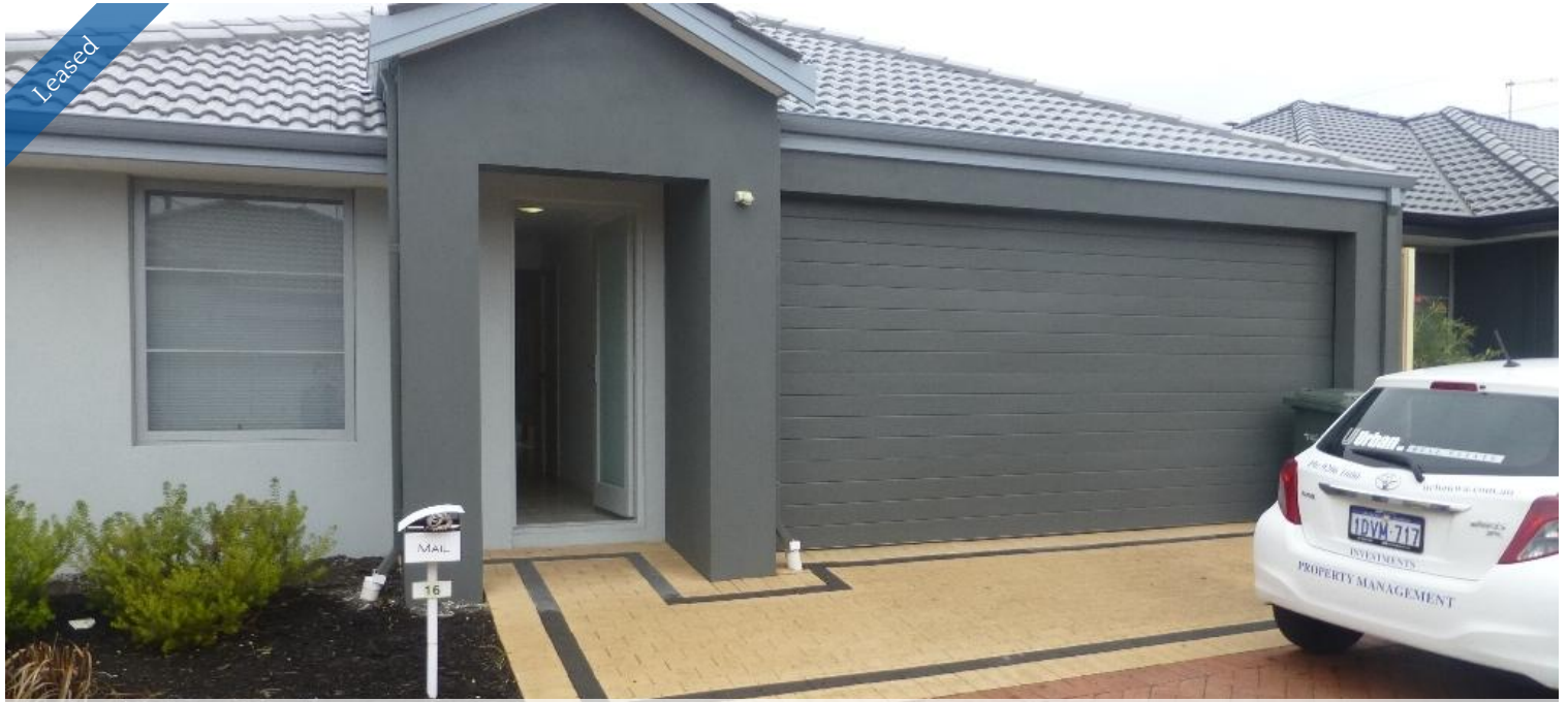
16 Chernoff Loop, Darch