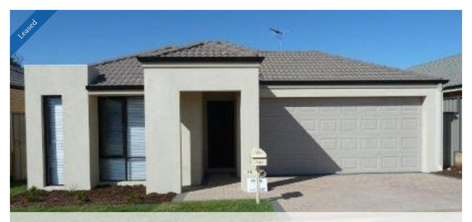
Lot 36 Grafton Rise, Baldivis