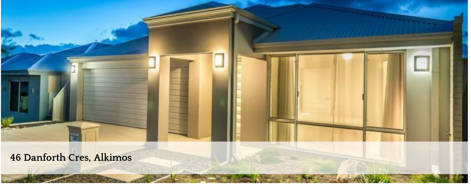
46 Danforth Cres, Alkimos