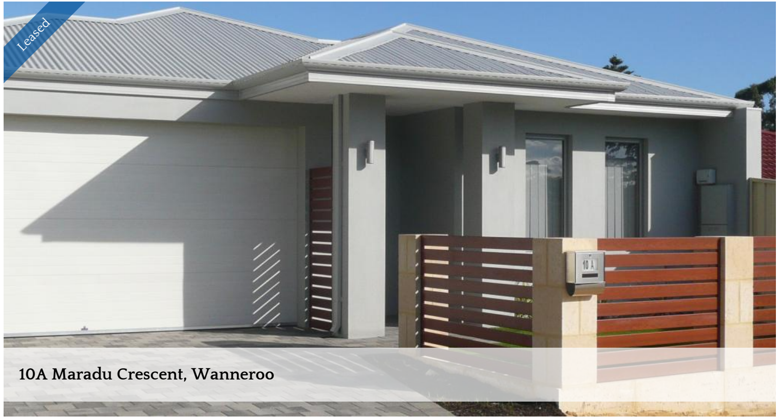
10A Maradu Crescent, Wanneroo