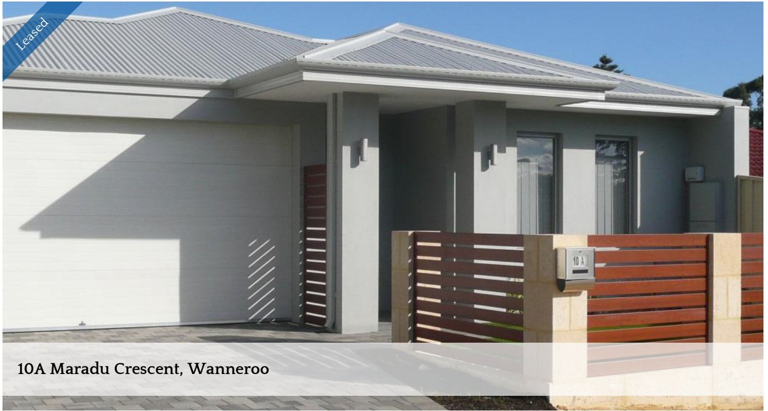
10A Maradu Crescent, Wanneroo