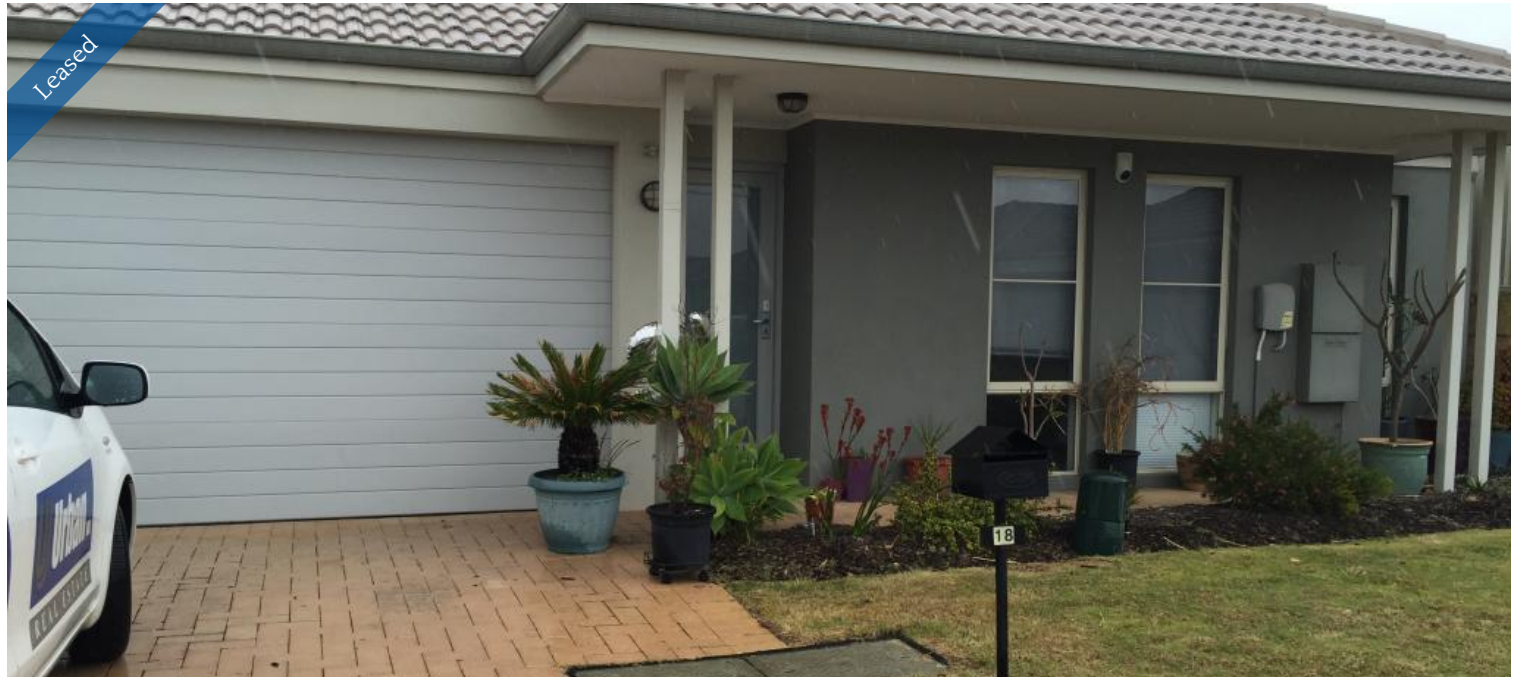
18 Portaferry Gardens, Ridgewood