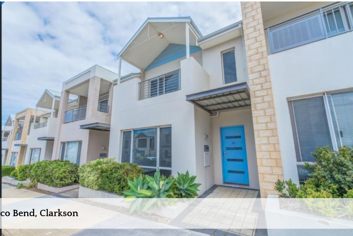
21 Orenco Bend, Clarkson