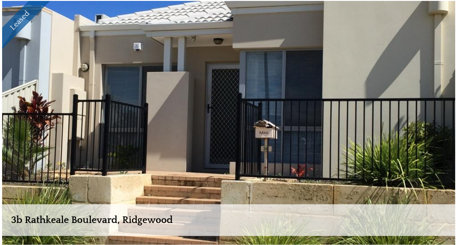
3b Rathkeale Boulevard, Ridgewood