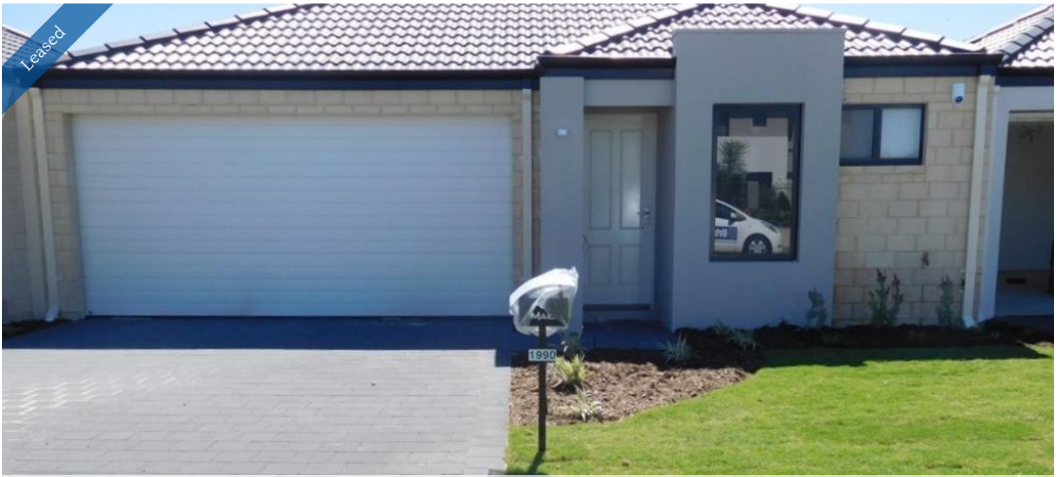
199D Landsdale Road, Landsdale