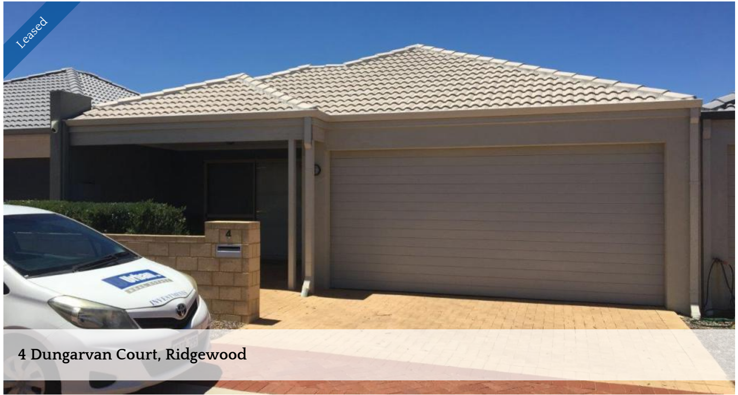
4 Dungarvan Court, Ridgewood