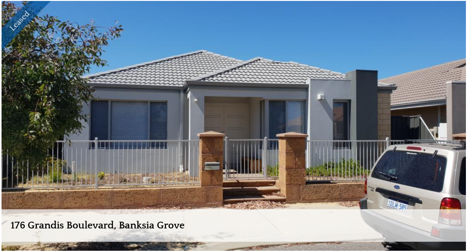
176 Grandis Boulevard, Banksia Grove