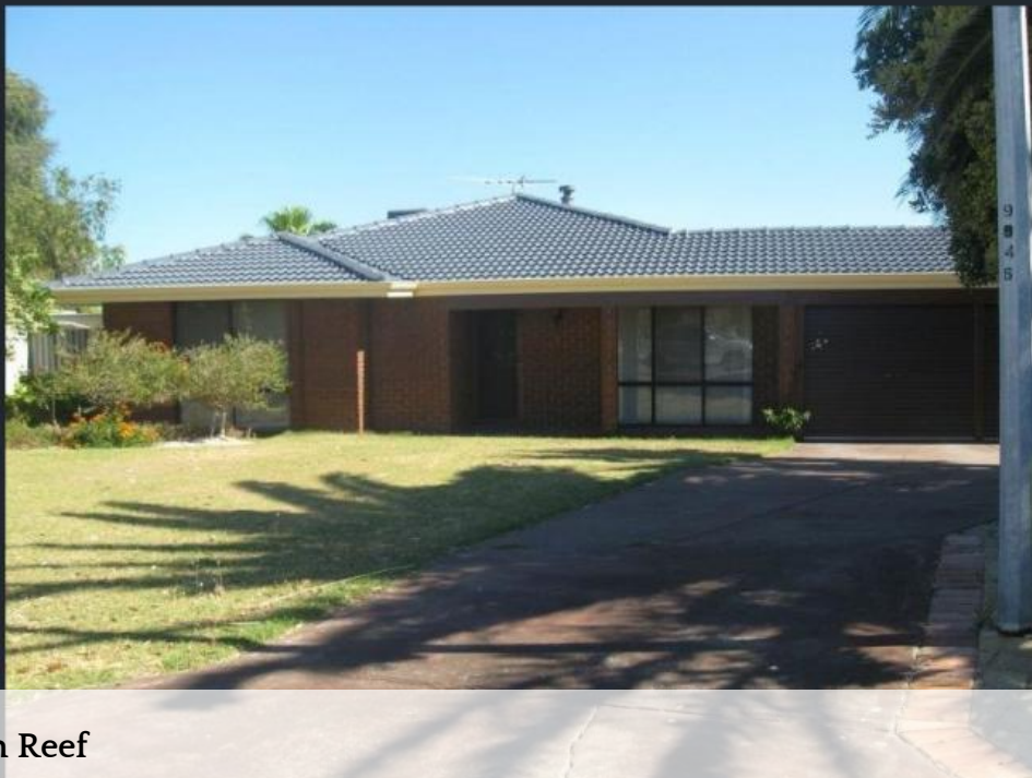
7 Kaba Ct, Ocean Reef