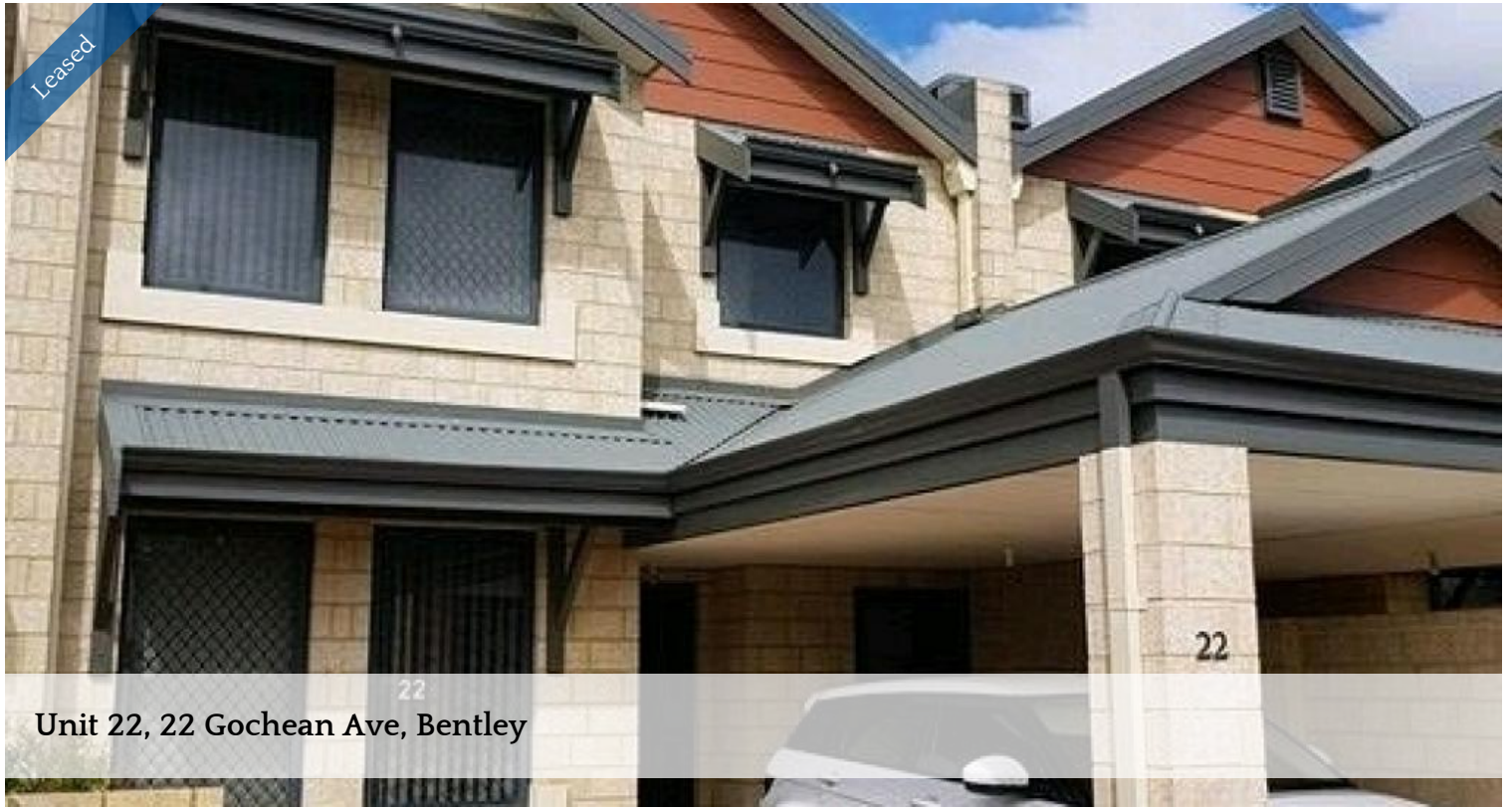
Unit 22, 22 Gochean Ave, Bentley