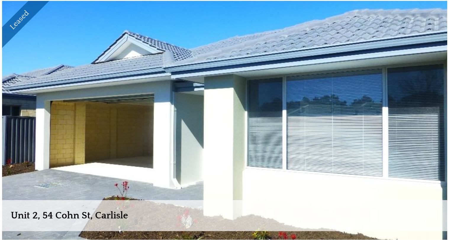
Unit 2, 54 Cohn St, Carlisle