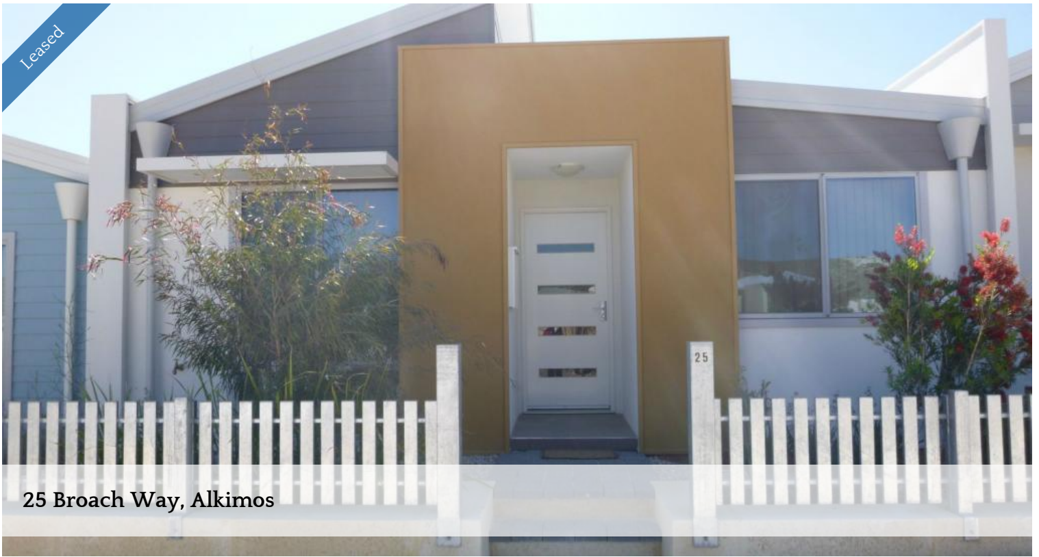
25 Broach Way, Alkimos