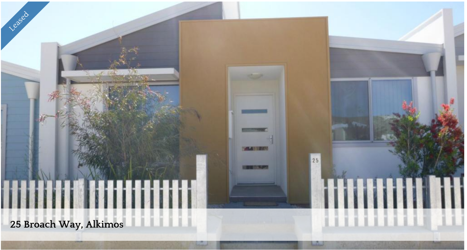
25 Broach Way, Alkimos