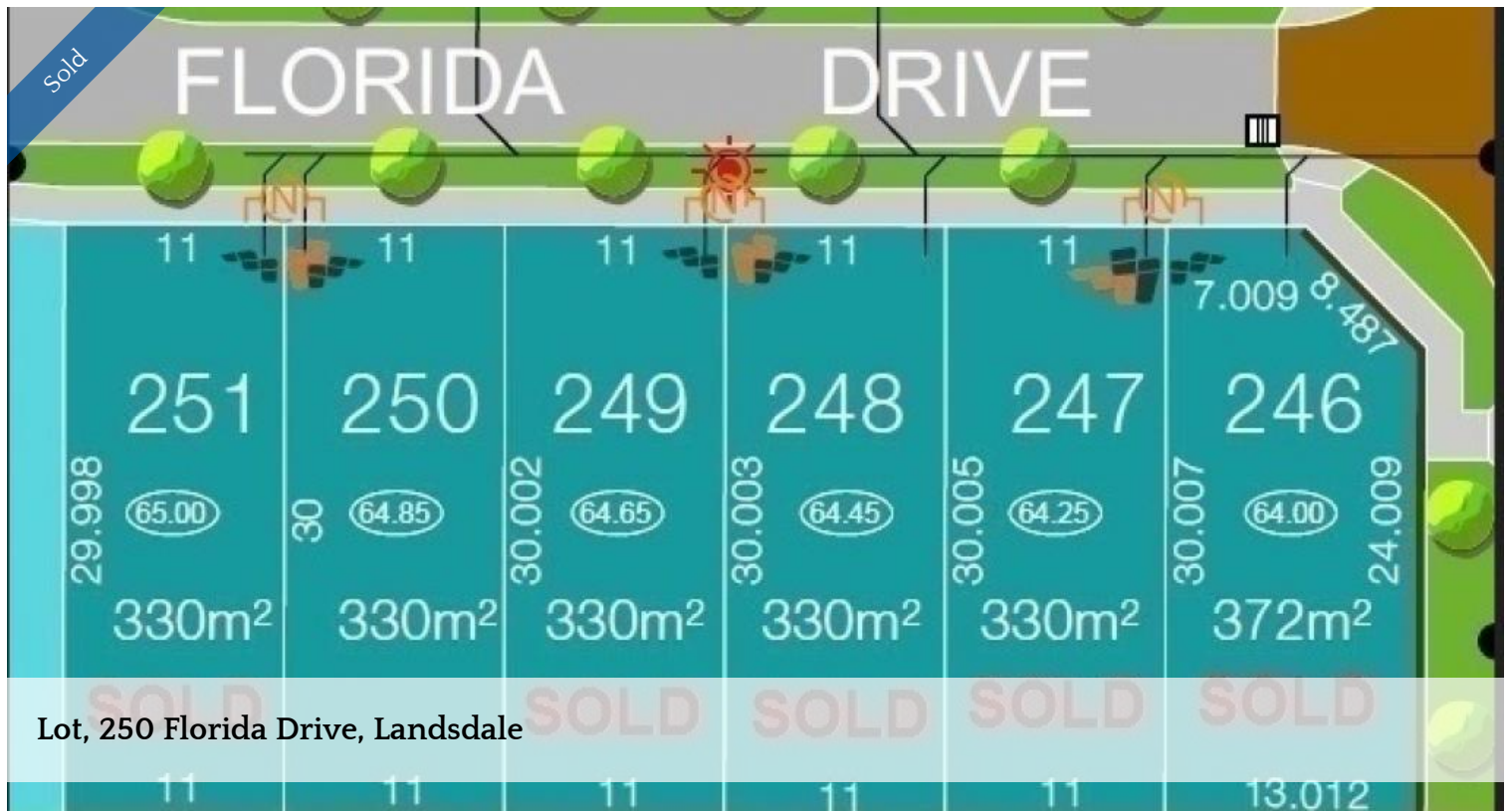
Lot, 250 Florida Drive, Landsdale