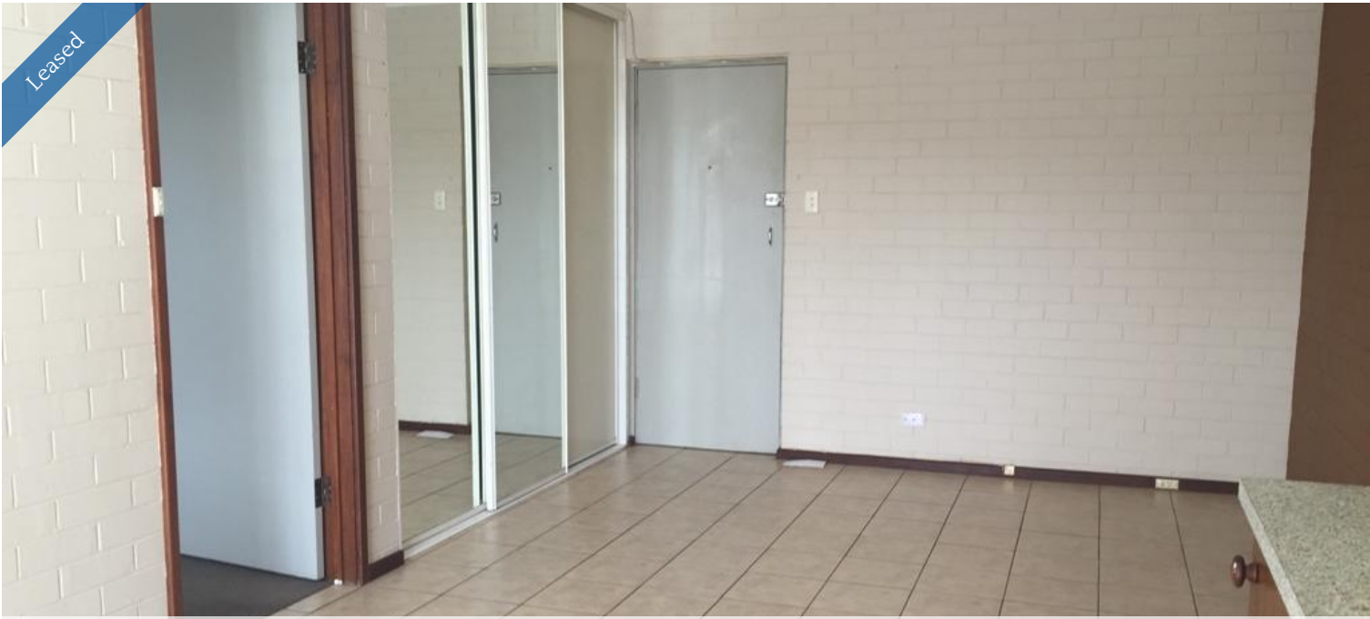
Unit 26, 86 Caledonian Ave, Maylands