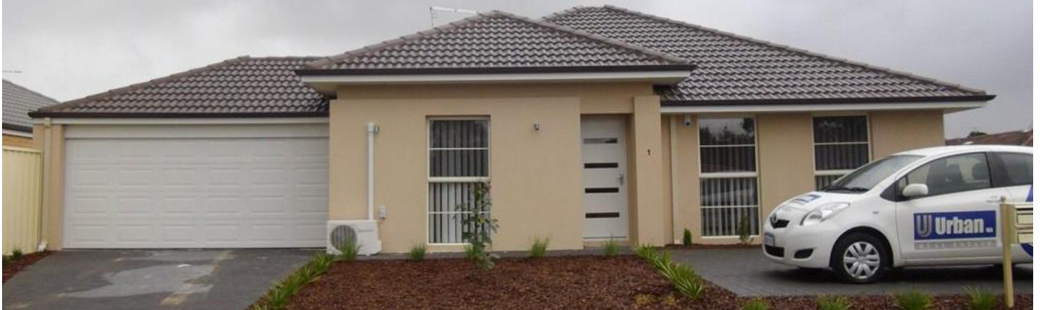
Unit 1, Lot 15 Third Avenue, Kelmscott