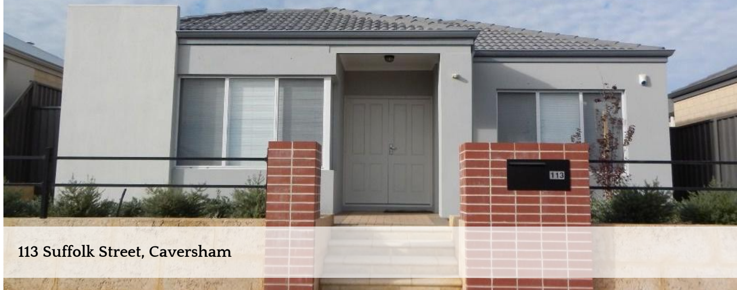
113 Suffolk Street, Caversham